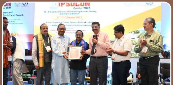
The IPS South Zonal branch expressed their gratitude and felicitated the organizing chairperson and secretary of IPSOCON for conducting the conference wonderfully.