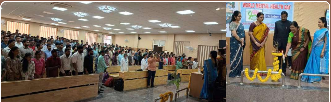
World Health Day was observed at Government Medical College, Vizianagaram