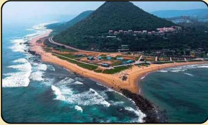
Rushi Konda Beach